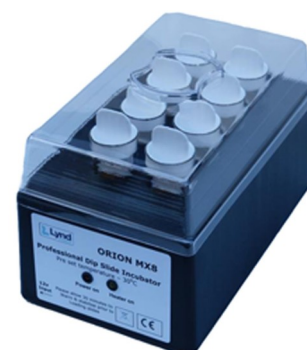
8 slide - Orion