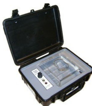
8 slide - Discovery