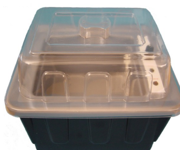
25 slide - Challenger