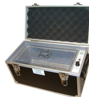
45 slide - Ranger

The Gnat, Orion Discovery, Challenger and Ranger can all be supplied with an optional 12v leads for use in cars.