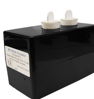
2 slide - Gnat